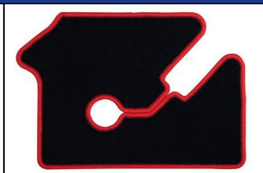
S2: Model DK2500AHC/3: 3 threads.